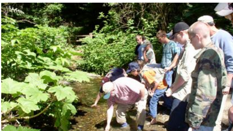
Macro Invertebrate Sampling Activity