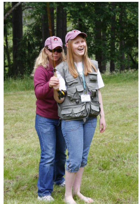
Fly Casting Instructions